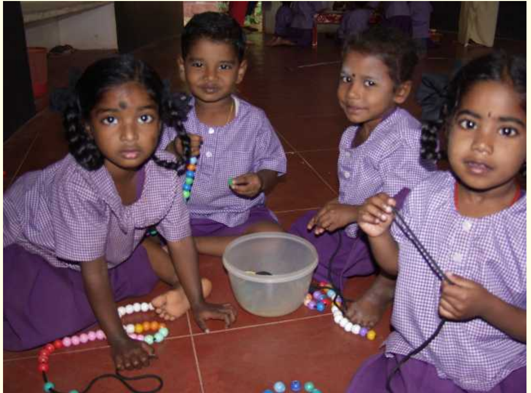
Learning to count.. on the future..